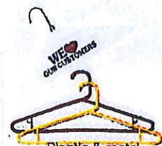
Plastic & metal hangers