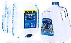
Empty plastic jugs