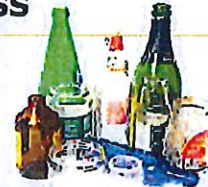
Clean glass jars & bottles