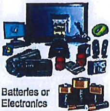
Batteries or Electronics