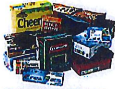
Boxboard, cereal boxes, dry food boxes