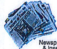
Newspaper & Inserts