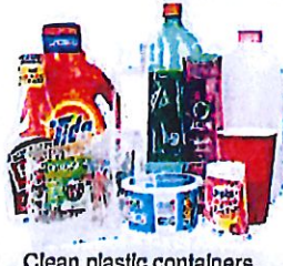
Clean plastic containers Plastics #1, #2, #4, #5, & #7 See bottom of container for #