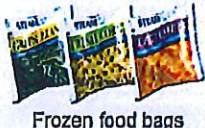
Frozen food bags & boxes