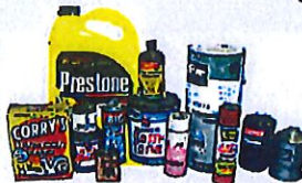
Hazardous or toxic product containers