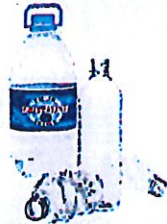
Empty plastic bottles