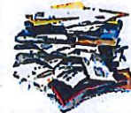
Mail, mixed paper, magazines and catalogs