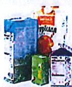
Empty wax-coated paper containers and juice boxes