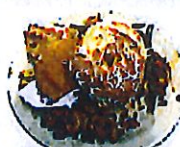
Food & wet waste, food contaminated paper & napkins