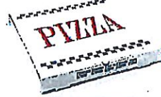
Take out pizza boxes free of food residue