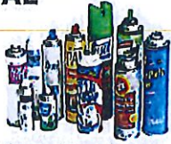
Empty Aerosol cans