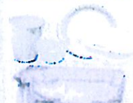
Polystyrene foam containers, peanuts and packing