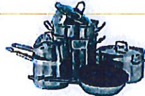
Pots & pans